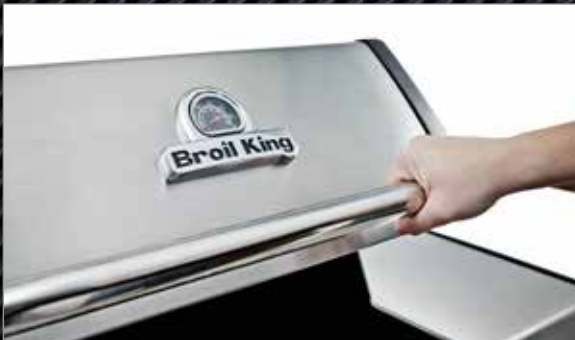
STAINLESS STEEL HANDLES