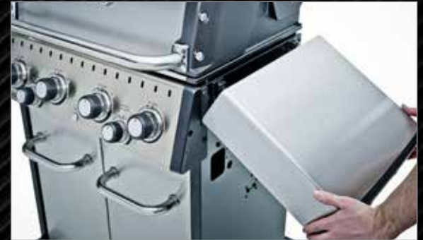
FOLD-DOWN SIDE SHELVES