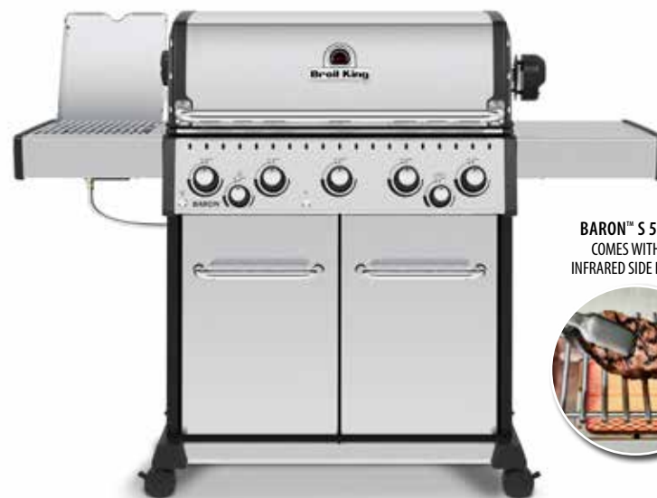
BARON™ S 590 IR COMES WITH AN INFRARED SIDE BURNER