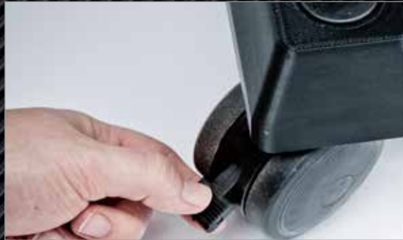
DURABLE LOCKING CASTERS