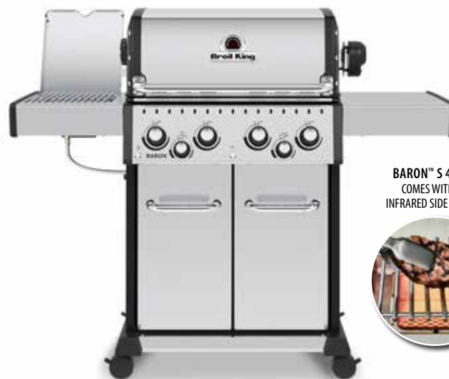
BARON™ S 490 IR COMES WITH AN INFRARED SIDE BURNER