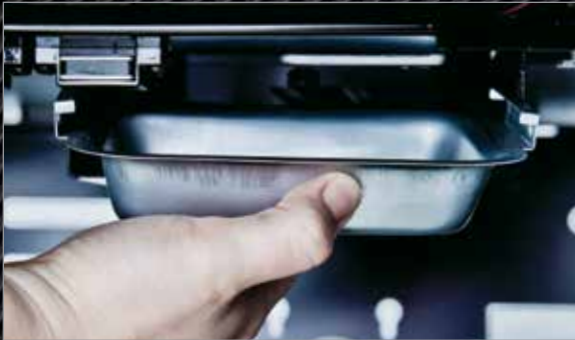
GREASE MANAGEMENT SYSTEM